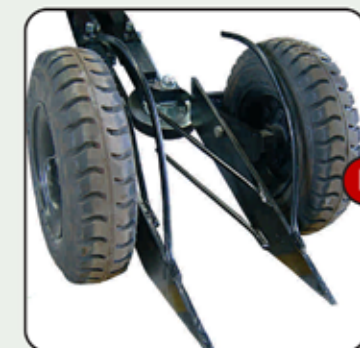
B. Leaf alignment guides

All of the harvester's mechanisms are driven by hydraulic motors enabled by the tractor's PTO.