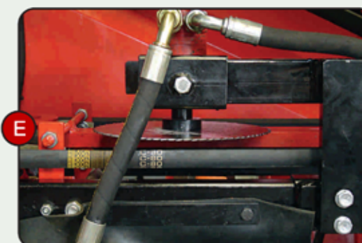
E. Cutting disk

Some of the remains of the soil is removed using a vibration system along the conveyor belts driven by hydraulic motors.