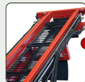
F. Packing belt

A second set of belts levels off the bulbs and a high speed toothed disk cuts the leaves at an adjustable height, removing the leaf part and placing the bulb on the packing belt.