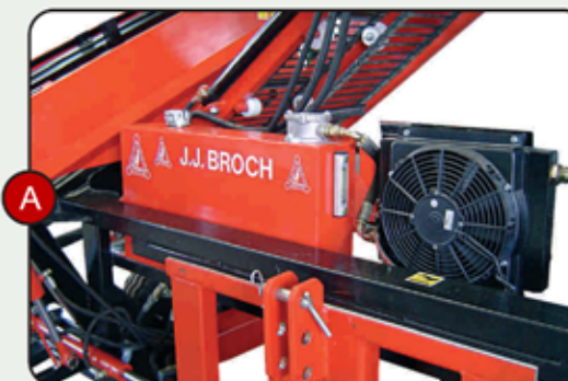
A. Hydraulic drive

All of the harvester's mechanisms are driven by hydraulic motors enabled by the tractor's PTO.