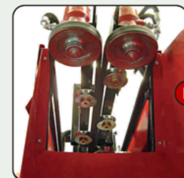
D. Conveyor and cleaning belts

A share is used to cut the radicular system of the garlic and then lifts it gently to be collected by the belt system. The position and depth of the blade can be adjusted hydraulically.