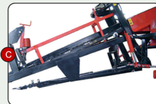
C. Front pulling up share

Two front guides lift any fallen leaves and align the garlic plants to make picking and collection along the conveyor belts easier.